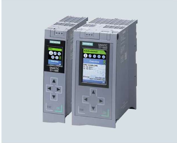
CPU 1513R-1 PN, CPU 1515R-2 PN