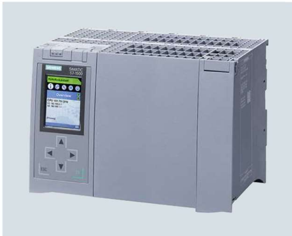
CPU 1517H-3 PN/FO